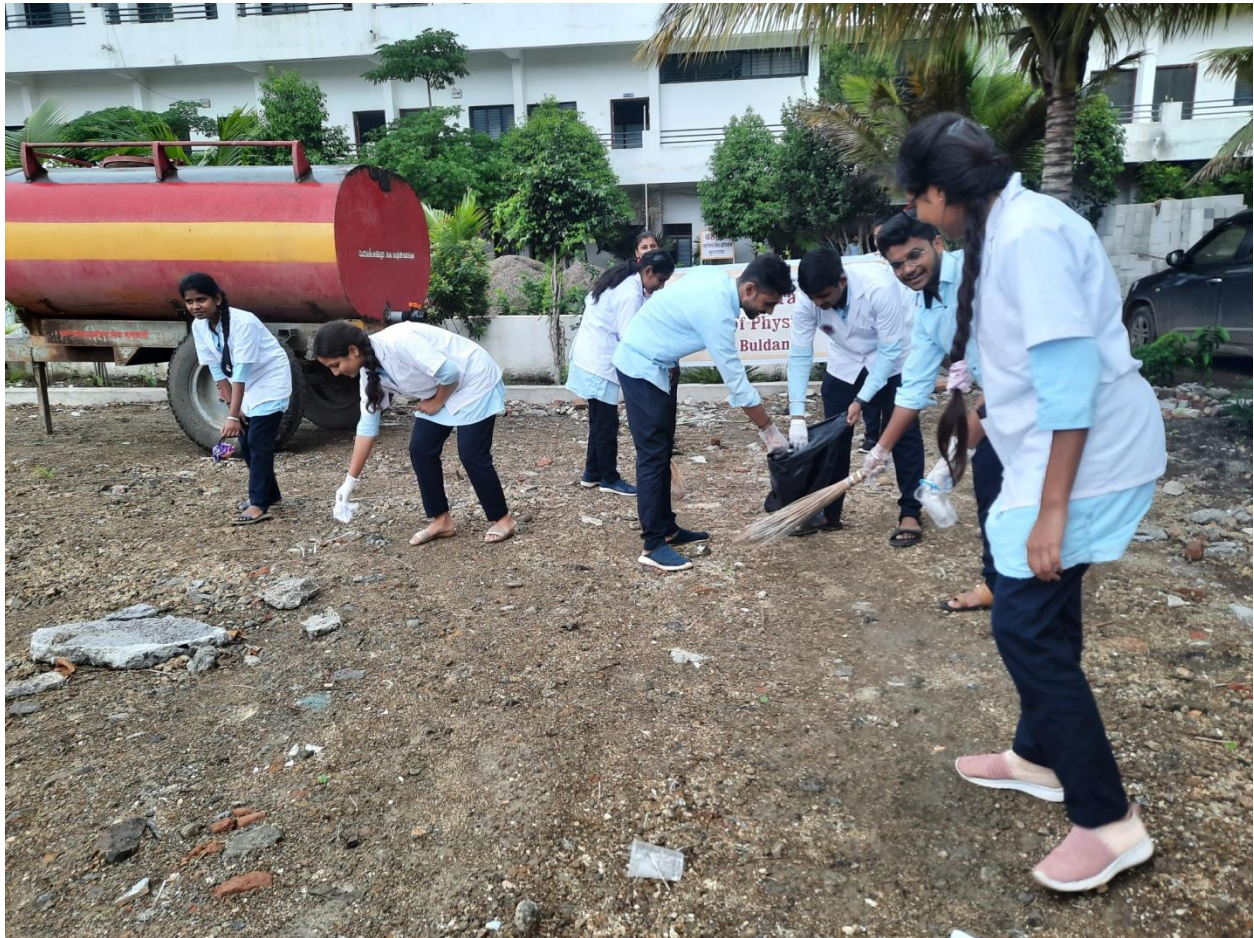
"Bharat Swaccha Abhiyan" held at Vasantprabha College of Physiotherapy Buldana on 1st May 2023