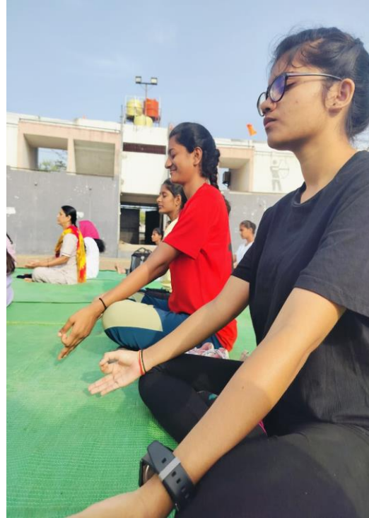
" YOGA DAY " celebration on 21st June 2023 held at Jijamata Stadium, Buldana