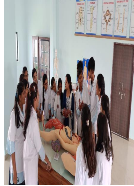
Guest lecture on " Cardiovascular System " held at Vasantprabha College of Physiotherapy on 13 July 2023.