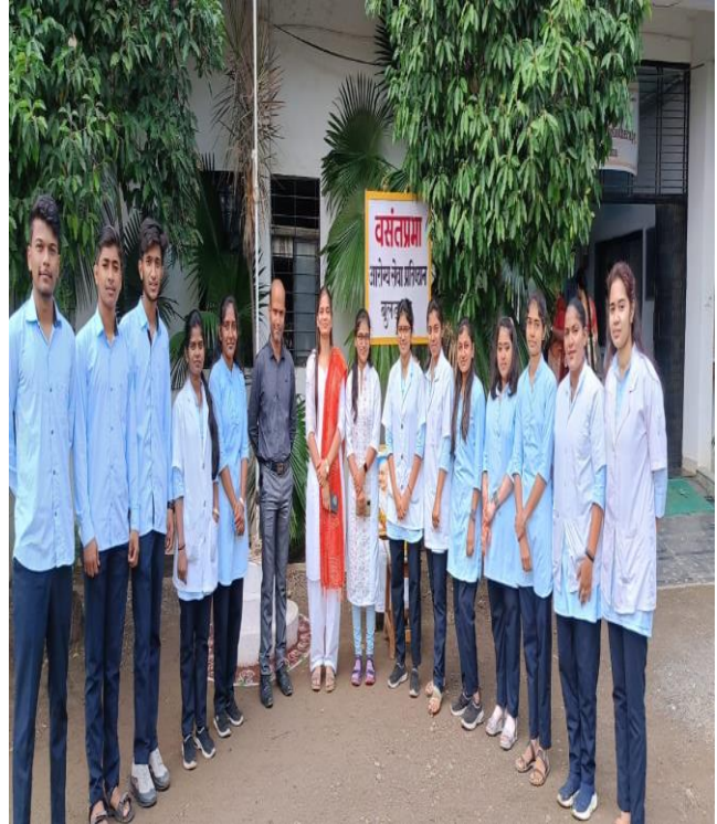
Celebration of "MAHARASHTRA DAY " at Vasantprabha College of Physiotherapy on 1st May 2023.