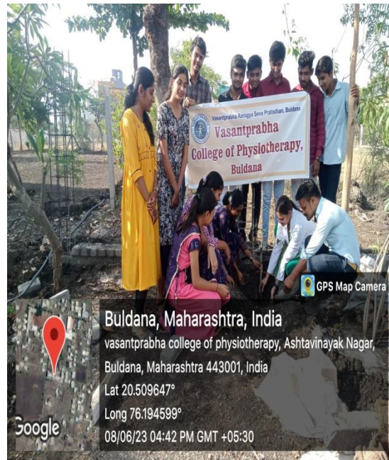
"TREE PLANTATION PROGRAMME "held at Vasantprabha College of Physiotherapy on 8 June 2023 on the occasion of SILVER JUBILEE OF MUHS .