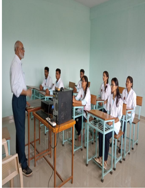
Guest Lecture on " Ergonomics " held at Vasantprabha College of Physiotherapy on 19 April 2023.