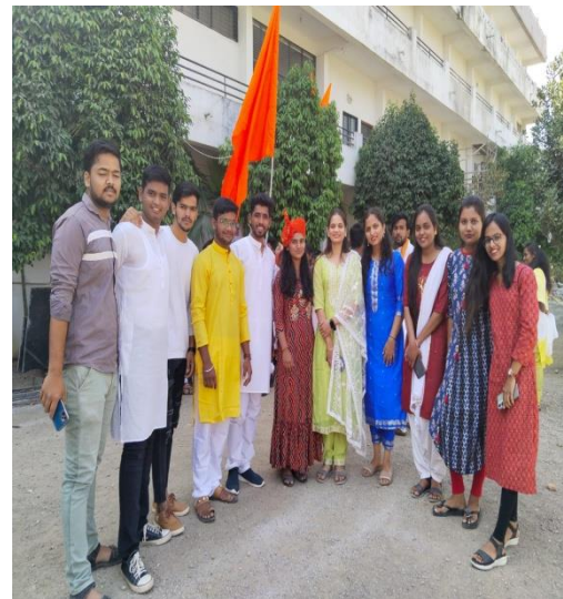
Celebration of " Chattrapati Shivaji Maharaj Jayanti " at Vasantprabha College of Physiotherapy on 19 Feb 2023