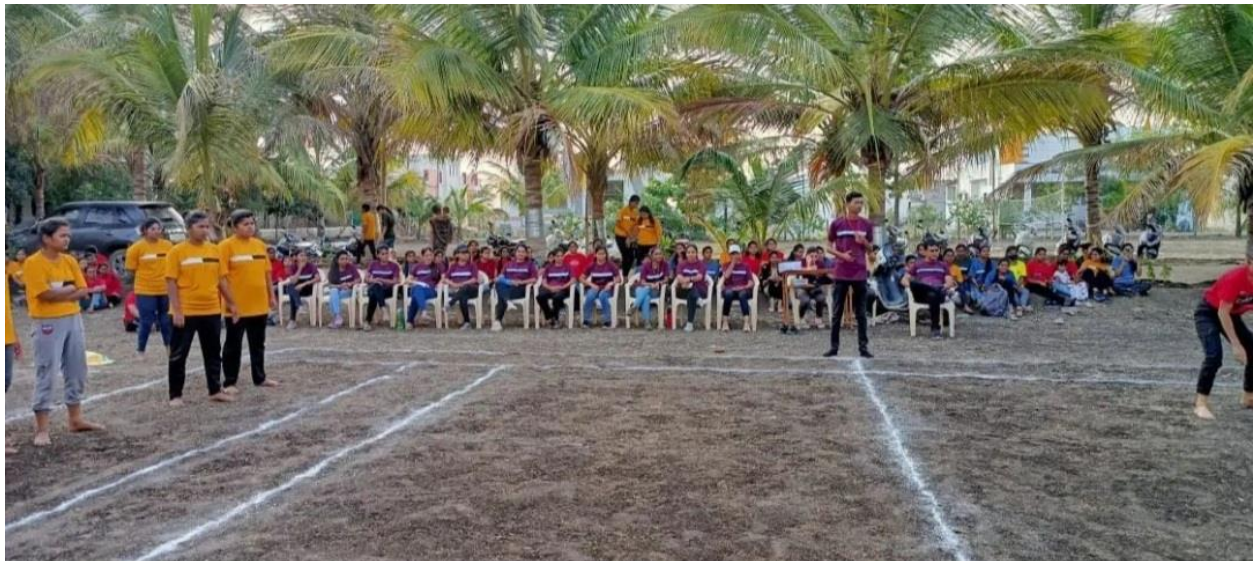
Celebration of " Annual fest " with programmes like Bollywood Day, Horror Day, Cultural Day , Sports Day, and Oath taking ceremony at Vasantprabha college of Physiotherapy in March 2023.