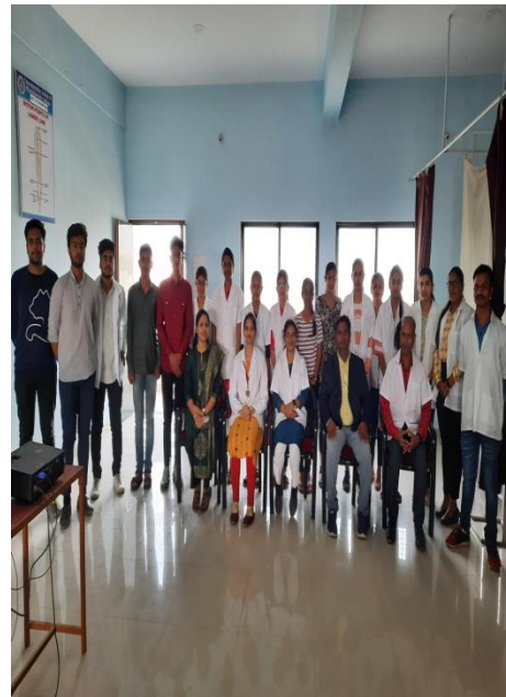
"Orientation Programme" of Batch 2022-23 held at Vasantprabha College of Physiotherapy on 1st Feb 2023.