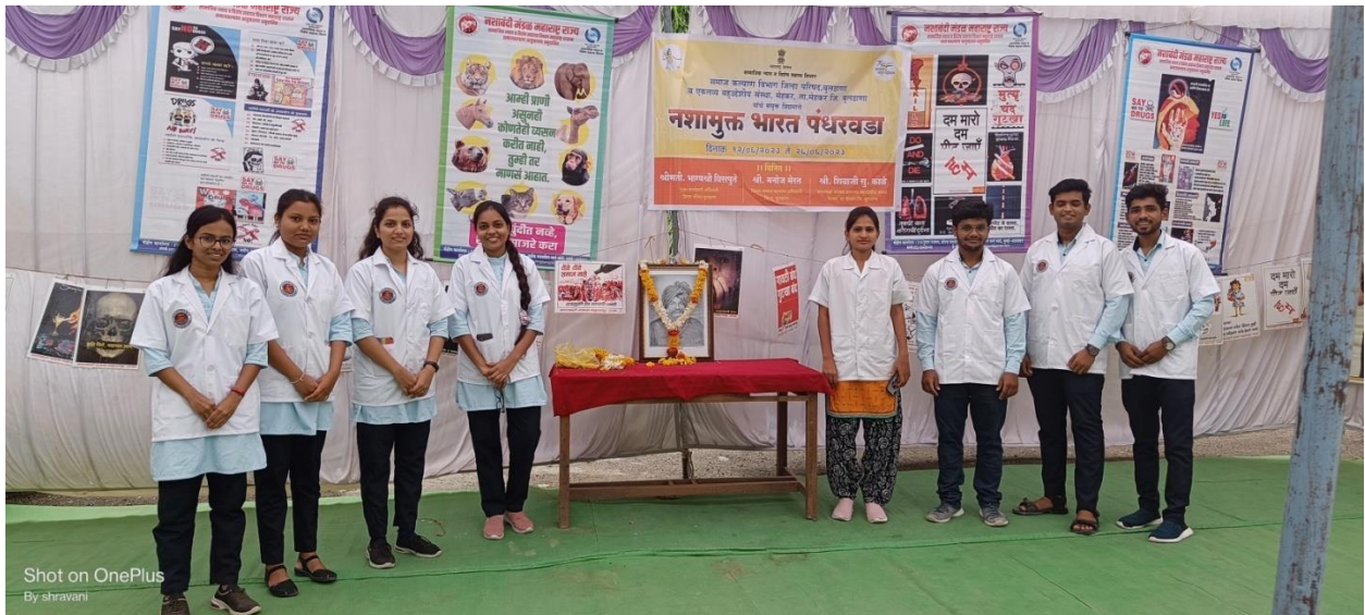
"NASHAMUKTA BHARAT PANDHARVADA " Rally held at ZP Buldana on 26 June 2023